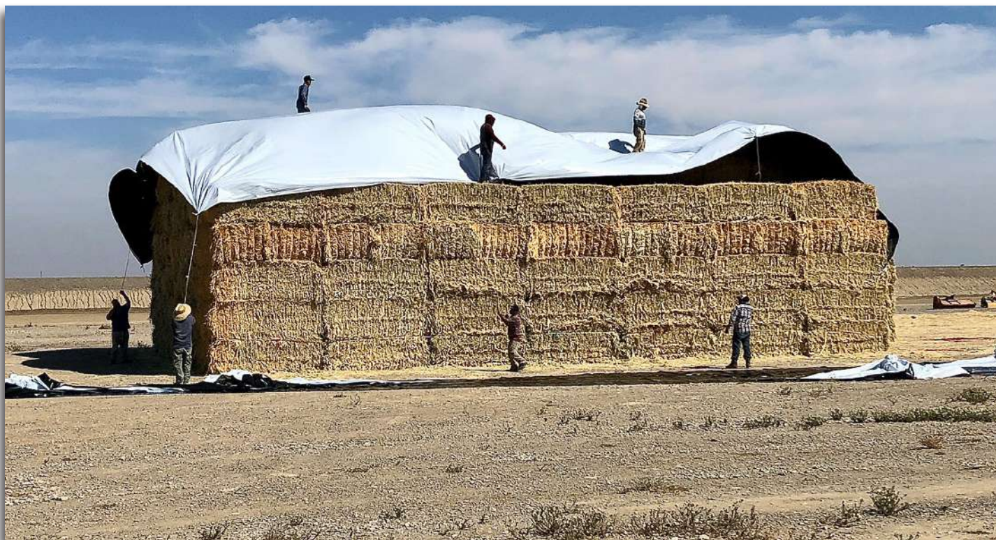
1 st "Hay Bales Being Covered Near Los Banos"