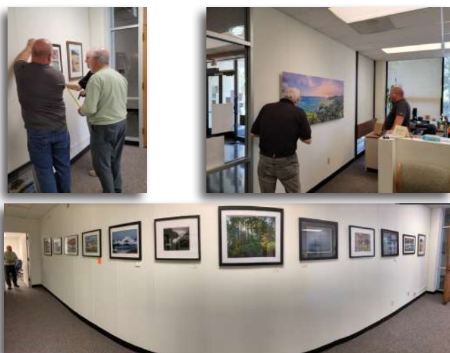
Activity on hanging morning and a panorama of the long gallery wall in July 2021