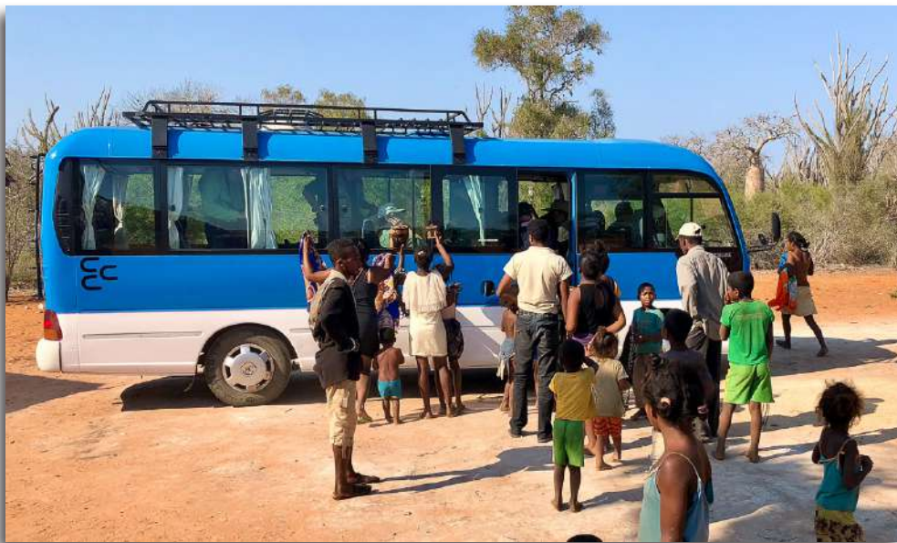
3 rd "Bird Tour Bus with Madagascar Natives" Kent VanVuren